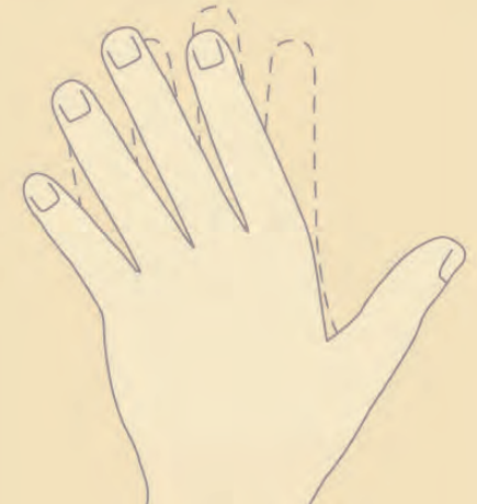
Figure 2: Drift of the fingers away from the thumb